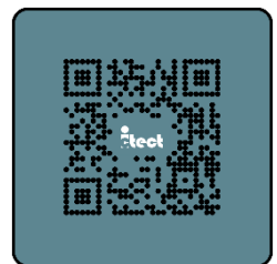
Game Changer Testimonial

Scan the QR code for a “game-changer” testimonial